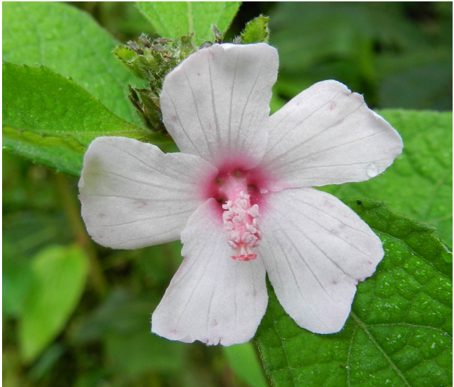
A 5-petal pink flower in the rainforest of Arfak mountains photo by Charles Roring - 1 September 2011 http://manokwaripapua.blogspot.com